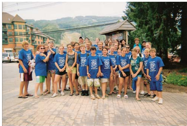
Senior Travel Campers and staff spend a fun-filled day at Mountain Creek.

Children in Grades 7-8 attended the Intermediate Day Camp held at the Kreps School. Activities included swimming, organized sports, and special lunch days at restaurants such as The Americana Diner, Marco Polo Buffet and Dairy Queen's Grill and Chill. The campers also went on a few trips per week to such destinations as Combat Zone Laser Tag and Seaside Heights beach and boardwalk.